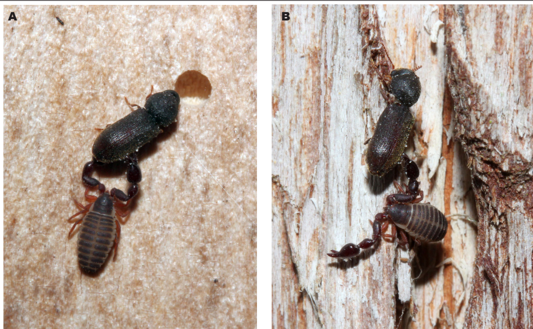
Fig. 2. Dendrochernes cyrneus hunting for Ptilinus pectinicornis females.