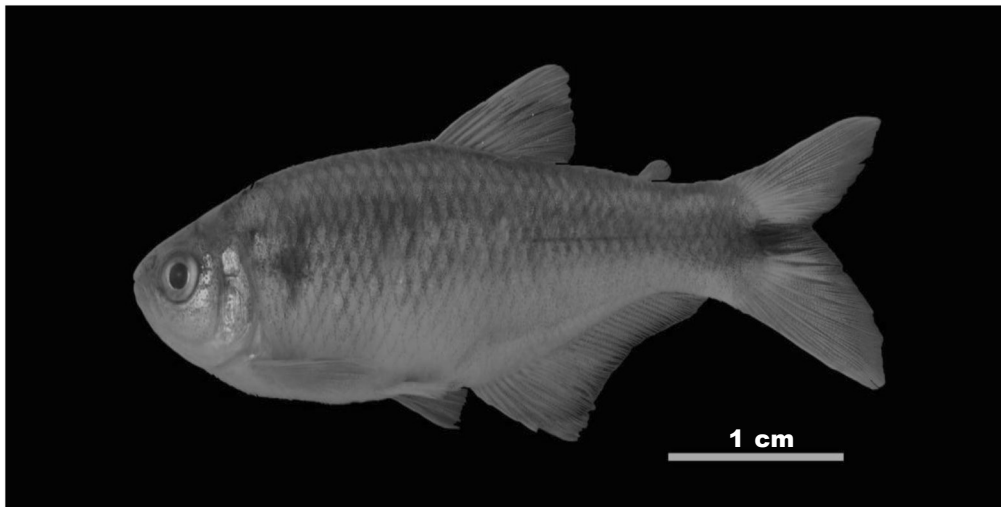
Fig. 1. Bryconamericus caldasi n. sp., holotype, male, IUQ 3714, 63.7 mm SL, San José County, La Libertad Creek, 200 m from La Libertad school on the San José, Arauca Road, Caldas, Colombia.

Fig. 1. Bryconamericus caldasi sp. n., holotipo, macho, IUQ 3714, 63,7 mm de longitud estándar, condado de San José, riachuelo La Libertad, a 200 m de la escuela La Libertad, situada en la carretera de San José a Arauca, en Caldas, Colombia.