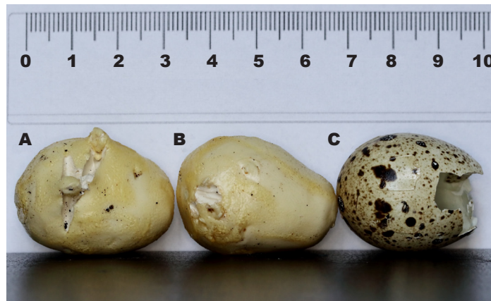
Fig. 2. Coated plasticine eggs with bill imprint (pecking) of small-bodied birds (A), with tooth imprint (gnawing) of small mammals (B) and broken quail egg (C).

Fig. 2. Huevos recubiertos de plastilina con marcas de picotazos de aves de pequeño tamaño (A), con marcas de roeduras de pequeños mamíferos (B) y huevo de codorniz roto (C).